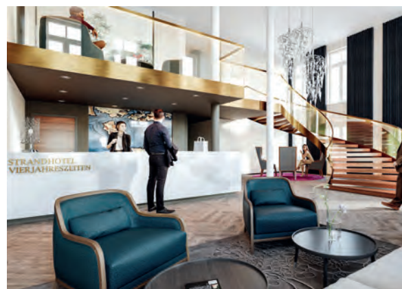
New: „Villa Düne“